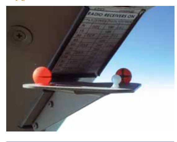
Fig. AS 1.2 Eye reference position

There are various ways to give an indication to the pilot where the eye reference position is located in the cockpit. One method is to mount an arrangement of three balls on the centre window post. Both pilots have to position their seats such (up-down, foreaft) that they see two balls aligned. The only possible head position that makes this possible is the eye reference position, see fig. AS 1.2.